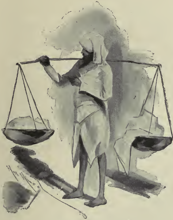
THE DAY'S SUPPLIES

across his shoulders. There were fish and loaves and meat and vegetables, and a bottle of Harvey's sauce, a tin of boot blacking, a